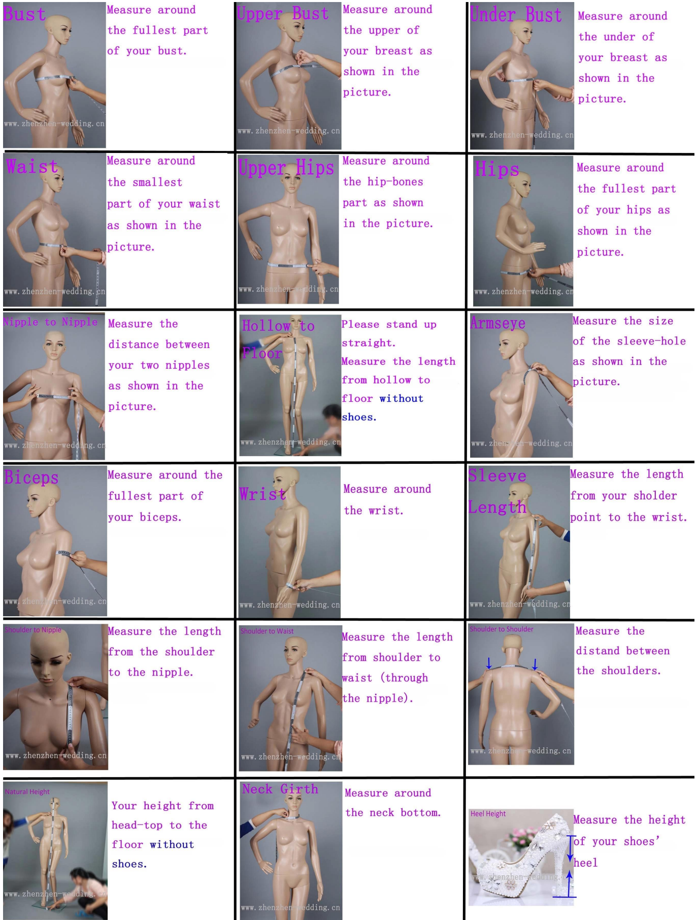
3: Tabella di cerimonia nuziale di colore del vestito: