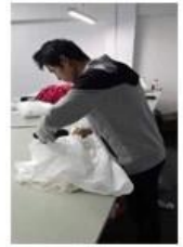
11:Taking photos 12:Packing 13:Shipping 14:Delivery