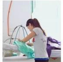
6:Pleating 7:Appliques 8:Hand-sewing 9:Hand-beading 10:Checking