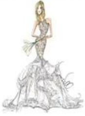
1:Designing 2:CAD Engraving 3:Tailoring 4:Sewing 5:Ironing