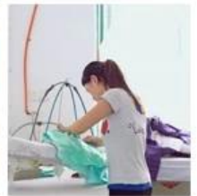
6:Pleating 7:Appliques 8:Hand-sewing 9:Hand-beading 10:Checking