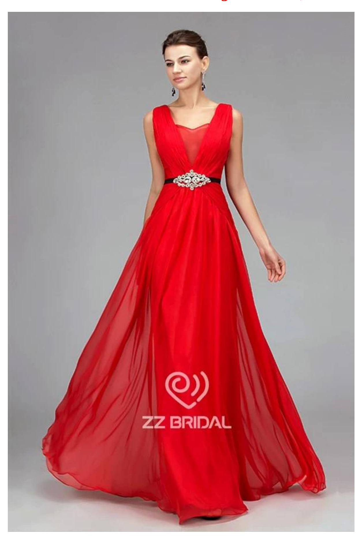
Suzhou HMY Wedding Dress Co., Ltd.